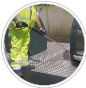
High pressure cleaning

Always in a spirit of perseverance and answer to the wishes of our different customers, Oeliatec provides a new technological solution at your services. All in one closed trailer, it is the essential tool that enables by its versatility to meet the various needs of technical services.