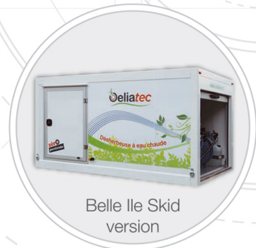
Belle Ile Skid version